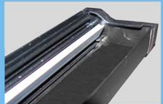
4. Push the other edge between the silver clamp bar and the black frame. Push the clamp bar down until it snaps into place.