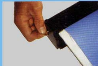
5. Remove the locking pin.