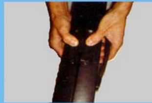
1. Open the case

When printing your graphics, leave .5" on the left side and 2.5" on the right side for attachment to the stand.