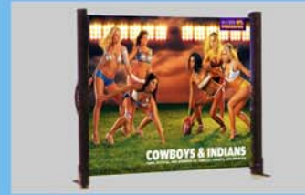
6. Snap down the bottom feet, and expand to locking position.