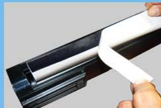
3. Stick one edge of the graphic to the adhesive tape. Be careful to place it straight.